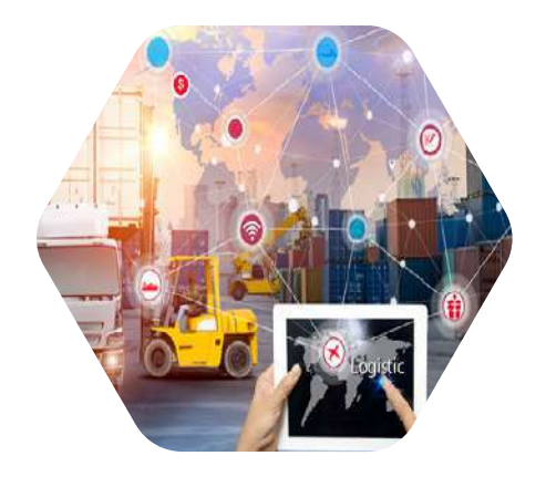
Logistic & Supply