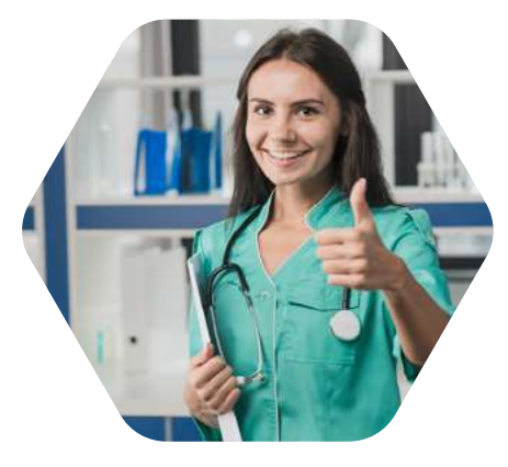
Medical & Healthcare